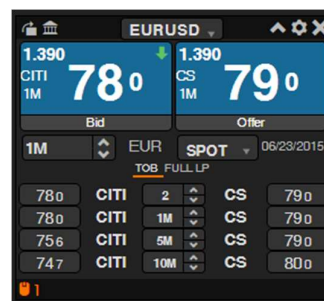
Top of Book

The FXSpotStream GUI is able to integrate with all post-trade STP channels. We also provide trade reports to download into Excel for your records and Drop Copy notifications via email.